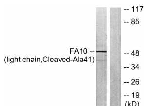
Western blot analysis of lysates from A549 cells, treated with etoposide 24uM 24h, using FA10 (light chain, Cleaved-Ala41) Antibody. The lane on the right is blocked with the synthesized peptide.