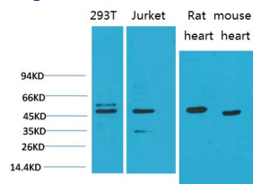
Western blot analysis of 1)293T, 2)Jurkat, 3)Rat Heart Tissue, 4)Mouse Heart Tissue with Smad3 Mouse Monoclonal antibody diluted at 1:2.000.