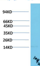
Western blot analysis of Human Serum using TTR Mouse Monoclonal antibody diluted at 1:2000