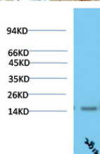
Western blot analysis of Human Serum using TTR Mouse Monoclonal antibody diluted at 1:2000